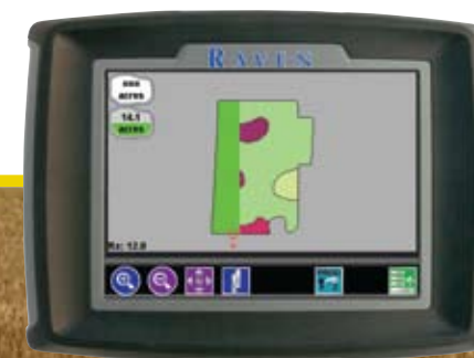
Envizio Pro's field coverage map lets you monitor progress and eliminate skips. The coverage map here overlays a prescription map used for variable rate applications (VRA). Single-product VRA is optional with Envizio Pro.

With the use of a simple thumb drive, Envizio Pro gives you a leg up on record keeping and field mapping. With bitmap files, you can quickly save and print reports showing your coverage map, acreage covered and more. The SHP (Shapefile) files are geo-referenced and can be imported into most standard mapping software.