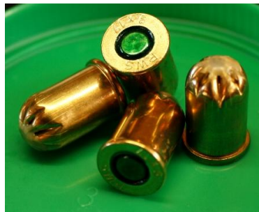
Fig 3. Example of Green Activators