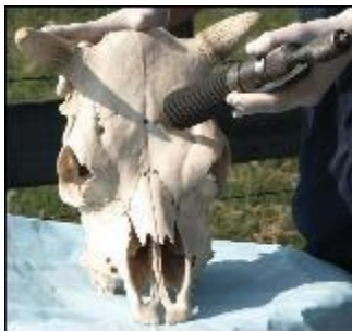
Fig 2. Proper placement of penetrating stunner